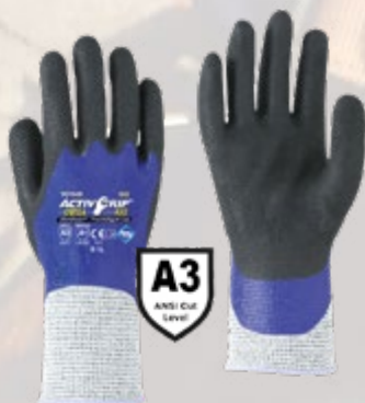
AG542 NEW TOWA ActivGrip™ Omega Max-542