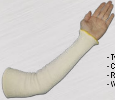
CSD18 Cotton Sleeve