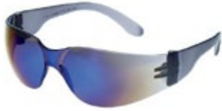
Z1715BM Blue Mirror Lens With Black Frame Safety Glasses