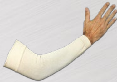
SMCSP18 Cotton Suspender "Non-Slip" Sleeve