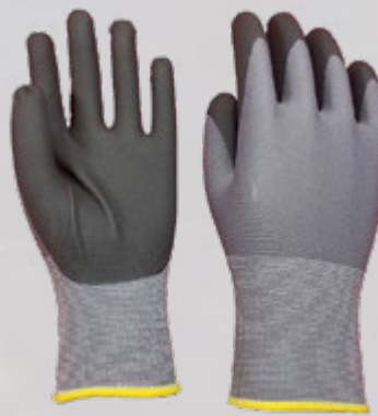
FN33GY Extreme Dexterity Foam Nitrile Palm Coated