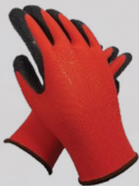
CL23RD "Spidey Grip" Latex Palm Coated