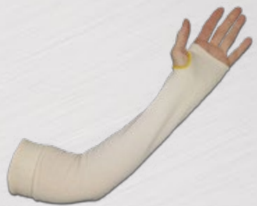
SMCSP18T Cotton Suspender "Non-Slip" Sleeve