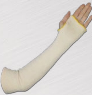
CSD18T Two-Ply Cotton Sleeve with Thumb Slot