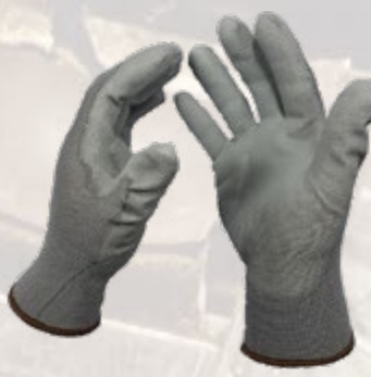
PU14GY Lightweight Grey Polyurethane Palm Coated