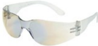
Z1715BMC Blue Mirror on Clear Lens With Clear Frame Safety Glasses