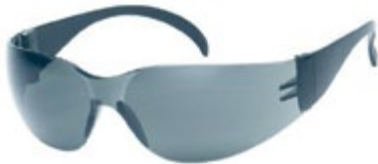
Z1715G Gray Lens With Black Frame Safety Glasses