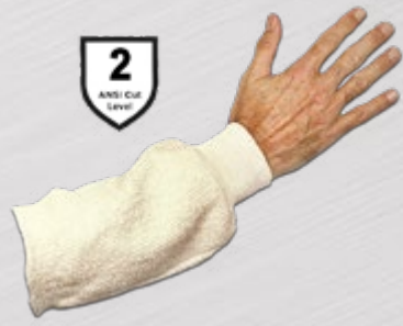
ST350-18 Single Ply Cotton Terrycloth Sleeve