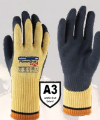
PG344 NEW TOWA PowerGrab® KEV4 344