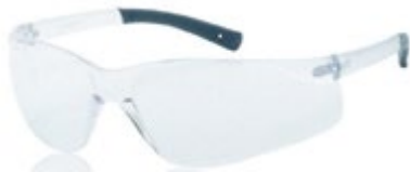
Z1715RTC Clear Lens With Clear Frame Safety Glasses