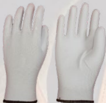
PU10WH Lightweight White Polyurethane Palm Coated